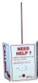
Quick Talk OutPost Callbox