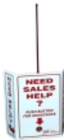
Quick Assist Callbox w/ Recorded Voice Message