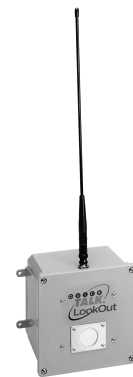
Quick Talk Lookout Callbox